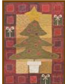
CALENDAR QUILTS CLUB